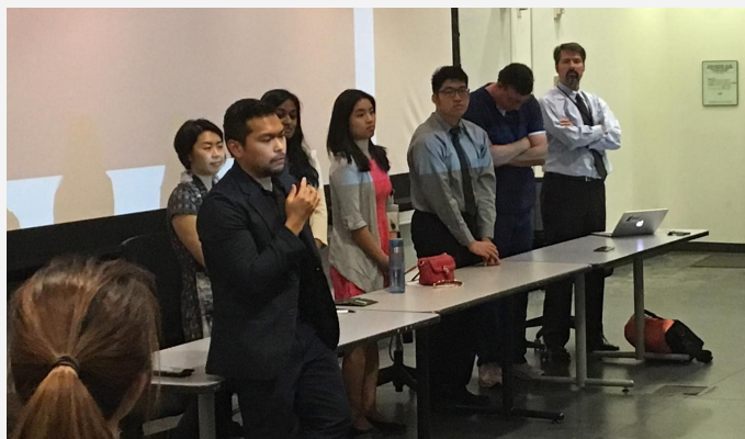
Joint Speaker Panel 2017

Our Omnicare Tour, where we present the opportunity for students to step inside a long term care pharmacy, is still being set up. Omnicare is currently undergoing staff restructuring so they are unable to accommodate us during this semester. Look out for updates regarding this event most likely in the spring! This is a great chance for students to meet the staff in the pharmacy, in addition to better understanding the inner workings of a long-term care pharmacy and what being a consultant pharmacist