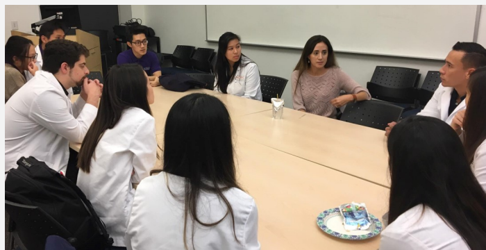
Consultant Speaker Panel 2017