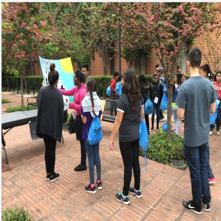
Pin the Tail on the Cow

At the annual Children's Awareness Carnival, the Bone Mineral Density Committee provided an educational presentation about strong bones to elementary school students. We emphasized the importance of eating healthy and receiving the proper amount of calcium and vitamin D. After the presentation, we played Pin the Tail on the Cow with the kids and gave out healthy snacks as a prize. Our booth was a hit with the kids!