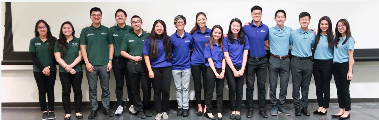
Executive Boards of AMCP– Pacific (green), ASCP-Pacific (purple), CSHP-Pacific (blue)