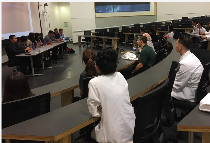
Pharmacy students attentively listening to the panel speakers during the Joint Speaker Panel